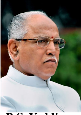
Sri. B.S. Yeddiyurappa Founder Chairman