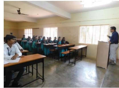
Student Teachers are participation in Discussion in the lecturing

IQAC initiative, Language Club and Siriyala Kalakendra, Shiralakoppa jointly organised a Lecturing and Demonstration Programme on the topic "Importance of Language use and Text Reading on 08-04-2019.