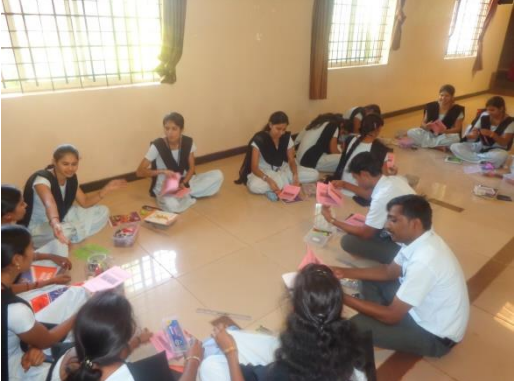
Student Teachers actively involved in preparing the Note pads