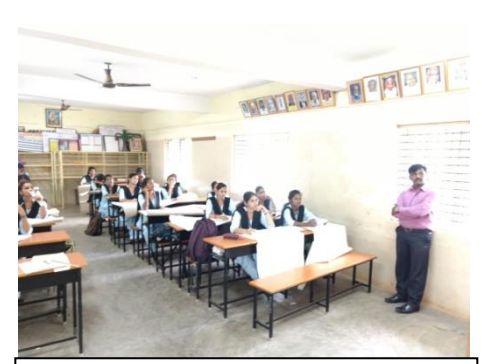
Student Teacher involved in envelop preparation