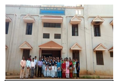
Student Teachers in front of Kumadvathi Apparel Training & Designing Centre