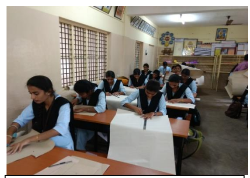
Student Teacher involved in envelop preparation