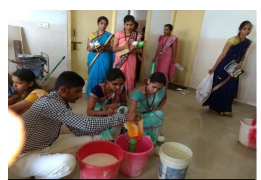
Student Teacher involved in the preparation of Phenol