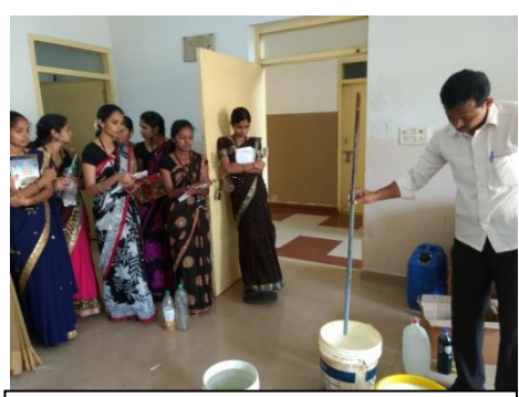
Vijay of Kumadvathi College of Education giving demonstration