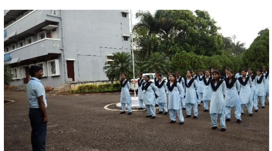
College Prayer talk, National anthem, state song and National salute Practice.