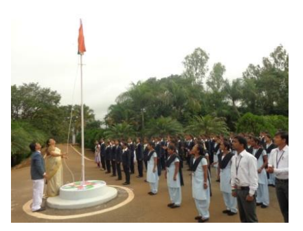
72<sup>nd</sup> Independence Day Celebration