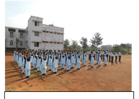
Sports Oath Taking