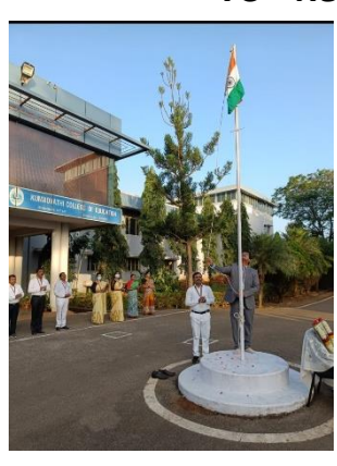
73<sup>rd</sup> Republic Day Celebration