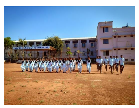
Republic Day rehearsal