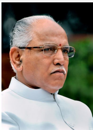
Sri. B.S. Yeddiyurappa Founder Chairman