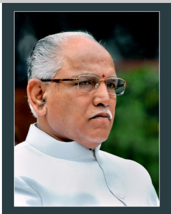
Sri. B.S. Yeddiyurappa Founder Chairman